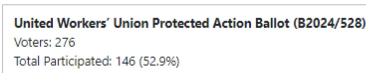
Diagram 1: Final Vote Participation

Final Ballot Audit: Friday, 31 May 2024 at 2.05pm AWST