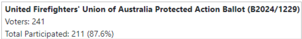
Diagram 1: Final Vote Participation

Final Ballot Audit: Tuesday, 8 October 2024 at 11.05am AWST