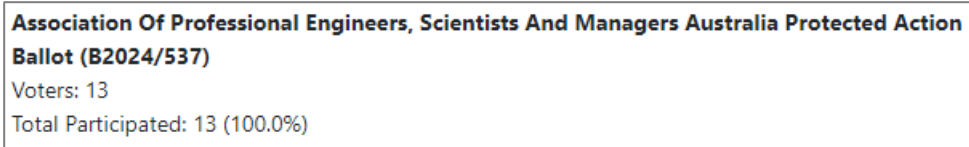
Diagram 1: Final Vote Participation

Final Ballot Audit: Monday, 27 May 2024 at 12.40pm AWST