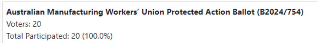
Diagram 1: Final Vote Participation

Final Ballot Audit: Friday, 28 June 2024 at 12.05pm AWST